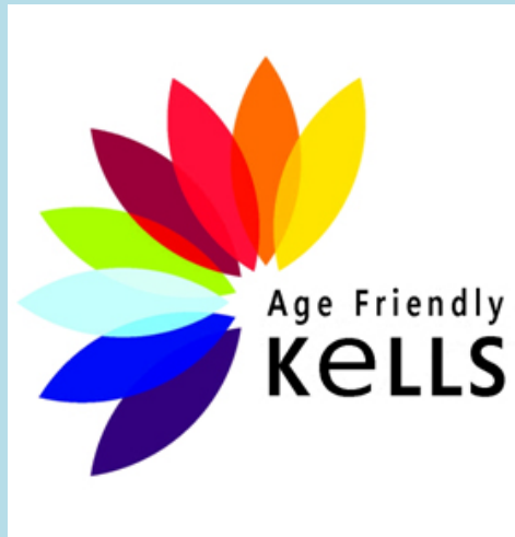
Launch of the Kells Age Friendly Business Recognition Scheme November 2013

2013 saw a focus on The Gathering and over 50 individual Gathering events were supported with funding.