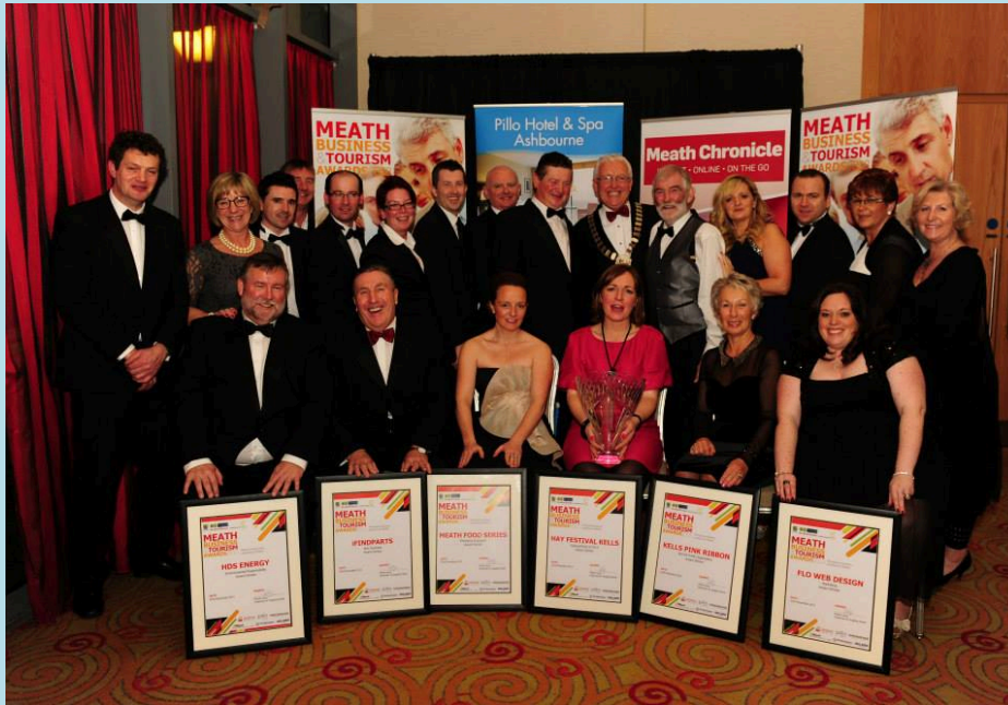
Meath Business & Tourism Awards 2013 - Winners

2013 saw a number of job announcements in the county including Alltech, HDS Energy, Mafic Black Basalt Ireland and Hanley Energy. There were also some positive indicators in the retail sector with almost 20 new businesses established in Kells alone during the year.