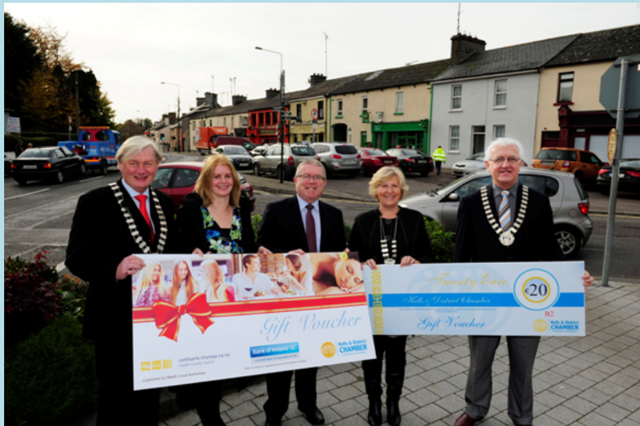
Launch of Kells Gift Voucher Initiative November 2013

The Make It....Meath marketing campaign progressed during 2013, with the completion of Make it Trim, Dunshaughlin, Dunboyne / Clonee and East Meath Economic Opportunities Brochures.