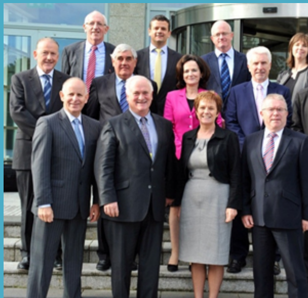
Economic Forum Members 2013

A voluntary 11 member Economic Forum was established in 2013 and met on two occasions during the year. In addition, Forum members have made themselves available on an individual basis to advise on specific aspects of the proposed Economic Strategy.