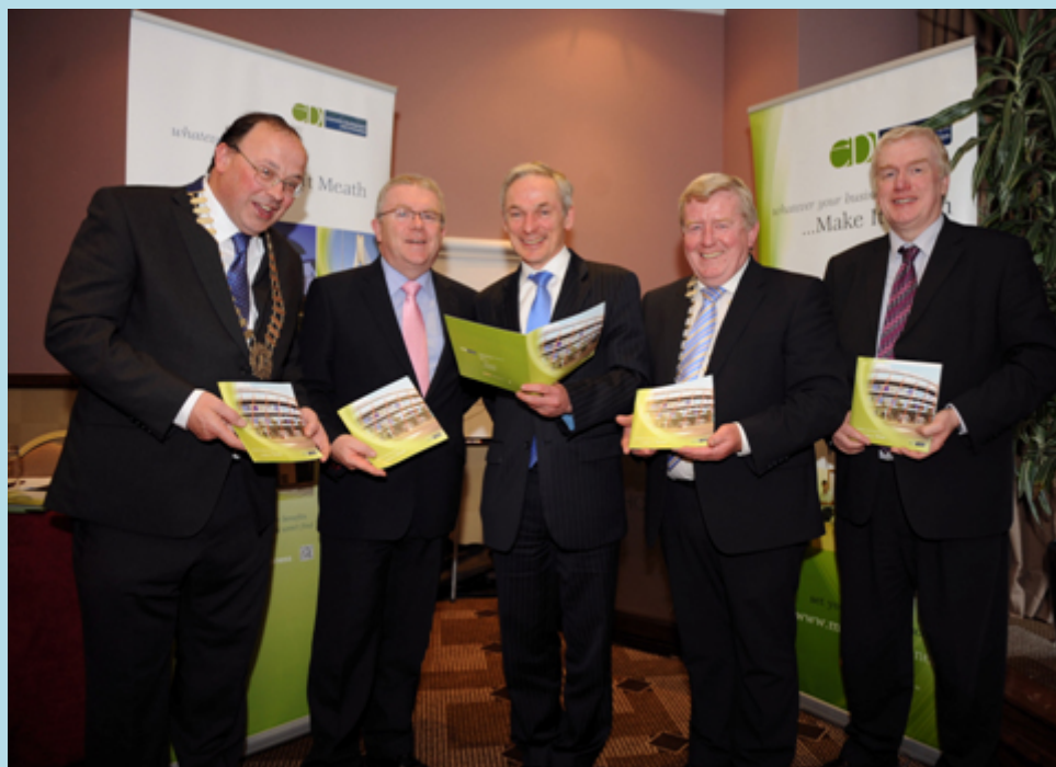
Launch of the Make it Trim Economic Opportunities Brochure (May 2013)