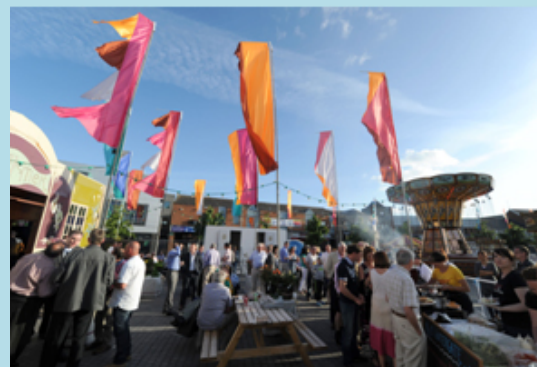
Navan Speigeltent Festival 2013