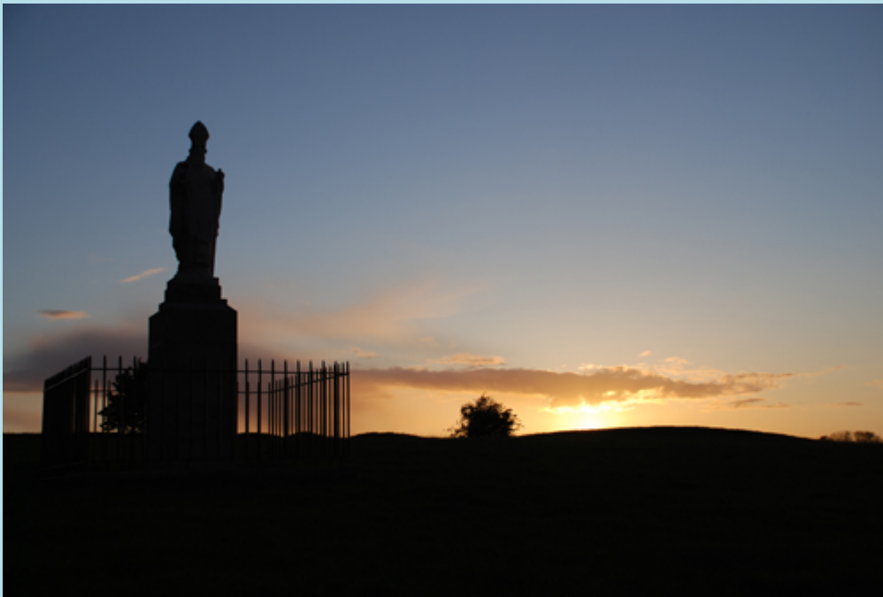
Hill of Tara