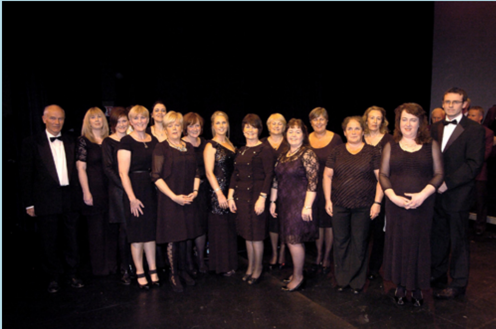
Meath County Council Choir