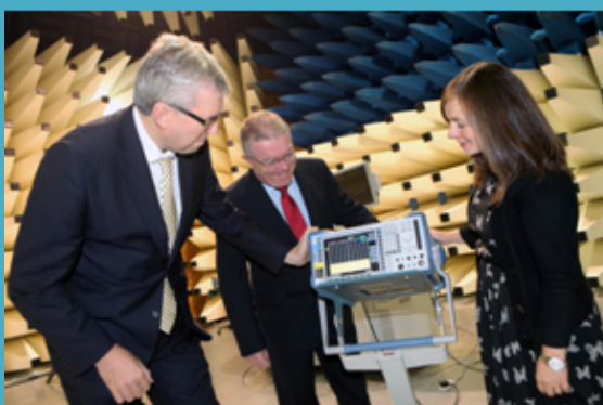
Launch of Life Sciences Supply Chain Collaboration October 2013

The Retail sector is being supported through a pilot “Age Friendly Business Recognition Scheme” initiative being piloted in Kells in partnership with the local Chamber of Commerce and Age Friendly Ireland. This will be rolled out to other towns when the pilot is complete in 2014.