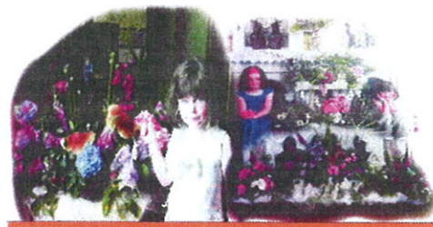
Joint 1 st Prize – St Mary's Church, Grangegeeth

St Mary's Grangegeeth Winner of Joint 1st Prize 2008