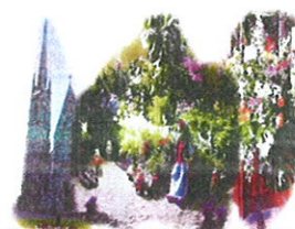
3 rd Prize - Kilskyre Church

Names of two representatives who would collect any potential prize at awards ceremony in October