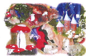
2 nd Prize - Church of Assumption, Batterstown

Address of contact person: _____ _____ _____