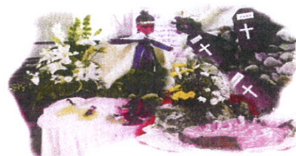
Joint 1 st Prize – Walterstown Church

St Mary's Grangegeeth Winner of Joint 1st Prize 2008