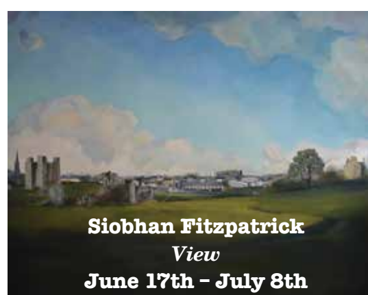
Siobhan Fitzpatrick View June 17th - July 8th

Siobhan Fitzpatrick is a painter; her work explores aspects of the Irish Landscape and the relationship between the urban and rural. This exhibition draws a connection between two eras of change and alteration within the Irish landscape; the recent period of widespread and contentious building during the Celtic tiger and the sensibilities of Landscape painting of the latter half of the 18th century, a period when aesthetic taste literally resulted in a pictorialisation of nature and the re-plantation and organisation of vast country estates to mimic the sublime and uncultivated.