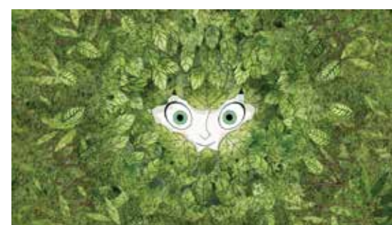
Cartoon Saloon Secret of Kells April 8th - 29th

An exhibition of 16 limited edition prints from the 2010 Academy award-nominated film The Secret of Kells by Cartoon Saloon.