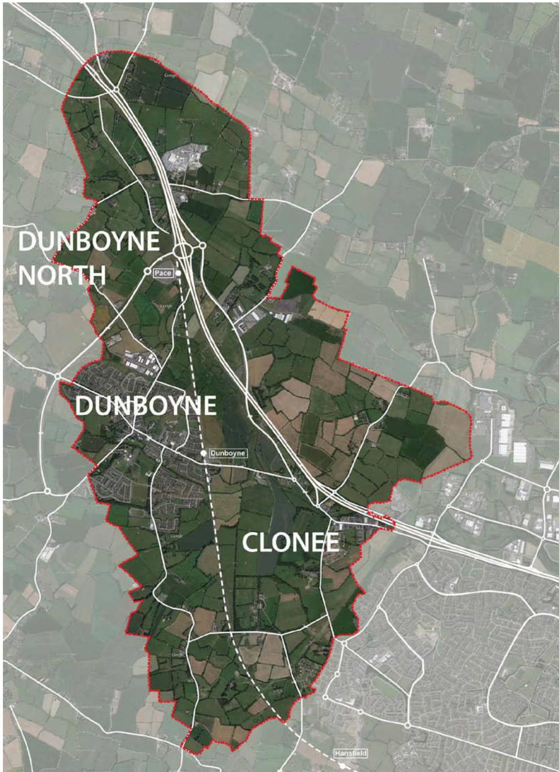
Dunboyne Clonee Growth Corridor, Strategic Framework Guidance 2015