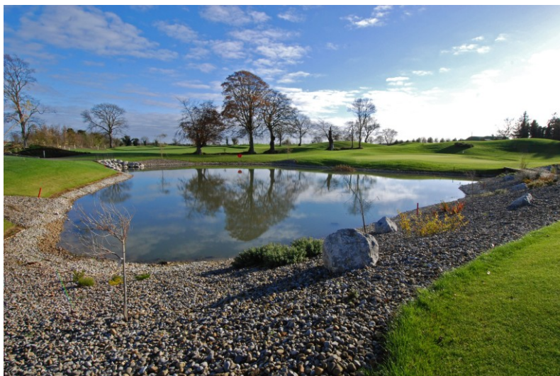
Golf Course adjoining the Knightsbrook Hotel

Recreation, leisure and sport are important components of a good quality of life and have major land use and transportation implications. Thus, adequate and accessible provision of open space, sports and recreational facilities is an important consideration in assessing the quality of life in a town or area.