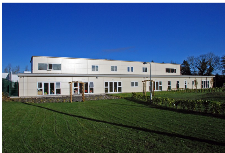
A recently constructed Childcare Facility in Trim

Guidelines on the provision of childcare facilities in residential developments are set out in Chapter 8 of this Development Plan 'Development Management Guidelines and Standards'.