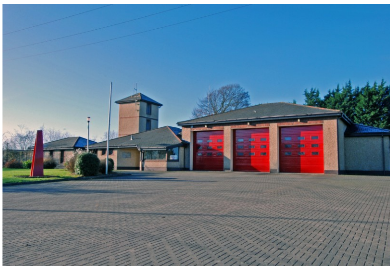
Trim Fire Station

An overview of the role of the Local Authority in providing a Fire Service is outlined in Chapter Two. The Planning Authorities shall aim to facilitate the Fire Service, an emergency service provider, in the delivery of a first class fire service having regard to the following policies.