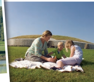
Meath - New Grange