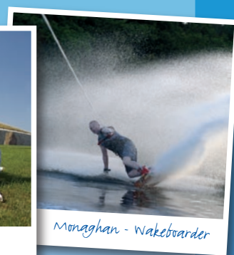
Monaghan - Wakeboarder