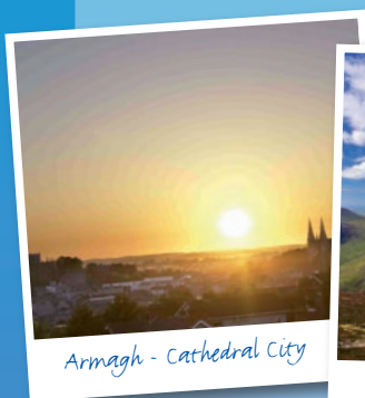
Armagh - Cathedral City