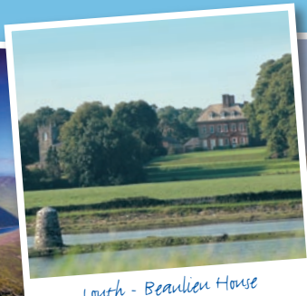
Louth - Beaulieu House