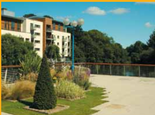
Poolboy Bridge, Navan