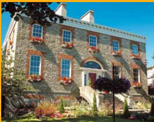
Parochial House, Navan

Navan boasts several famous offspring such as Sir Francis Beaufort, a Royal Navy Admiral who formulated the Beaufort Scale of wind forces. Comedians such as