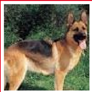
German Shepherd Alsáiseach