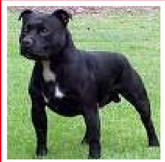
Staffordshire Bull Terrier Tarbh-bhrocaire Staffordshire