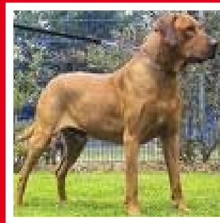
Rhodesian Ridgeback Dronnach Róidéiseach