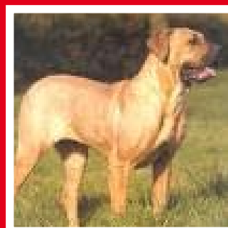
Japanese Tosa Tósa Seapánach