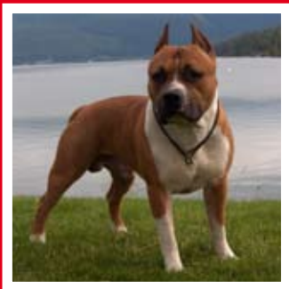
American Pit Bull Terrier Tarbh-bhrocaire Meiriceánach