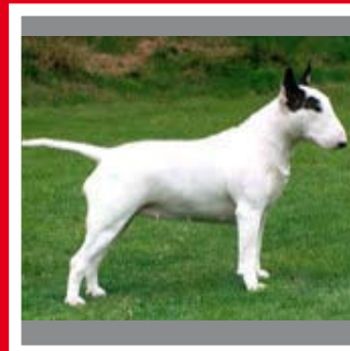
English Bull Terrier Tarbh-bhrocaire Sasanach