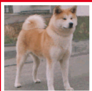
Japanese Akita Aicíte Sheapánach