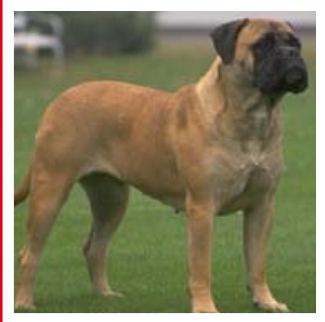
Bull Mastiff Tarbh-mhaistín