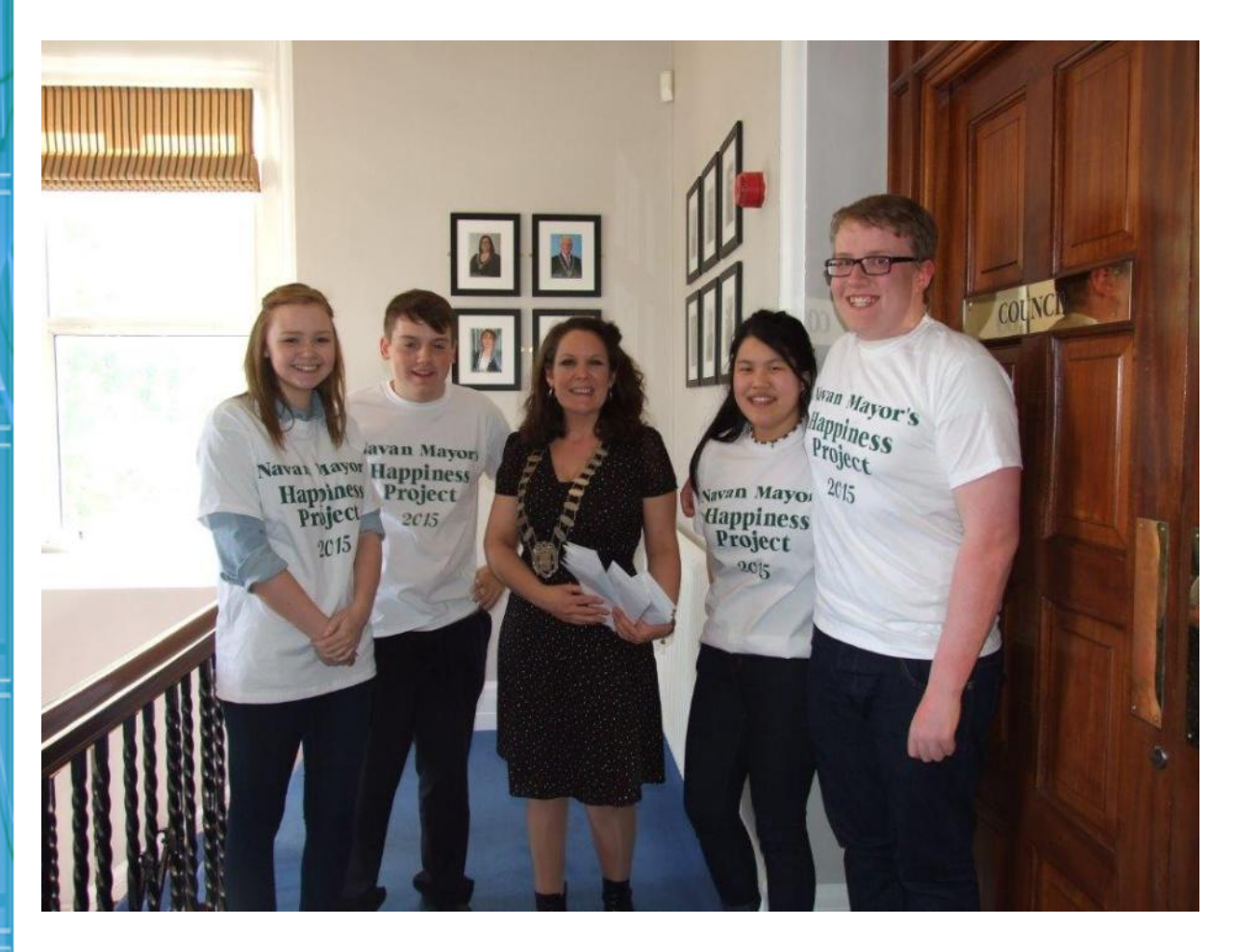
Members of the Navan Mayor's Happiness Project visit the Council Chamber with the Mayor of Navan