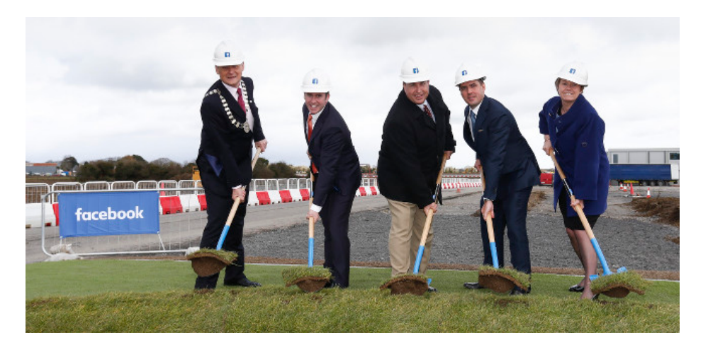
Groundbreaking ceremony at the Facebook data centre site in Clonee