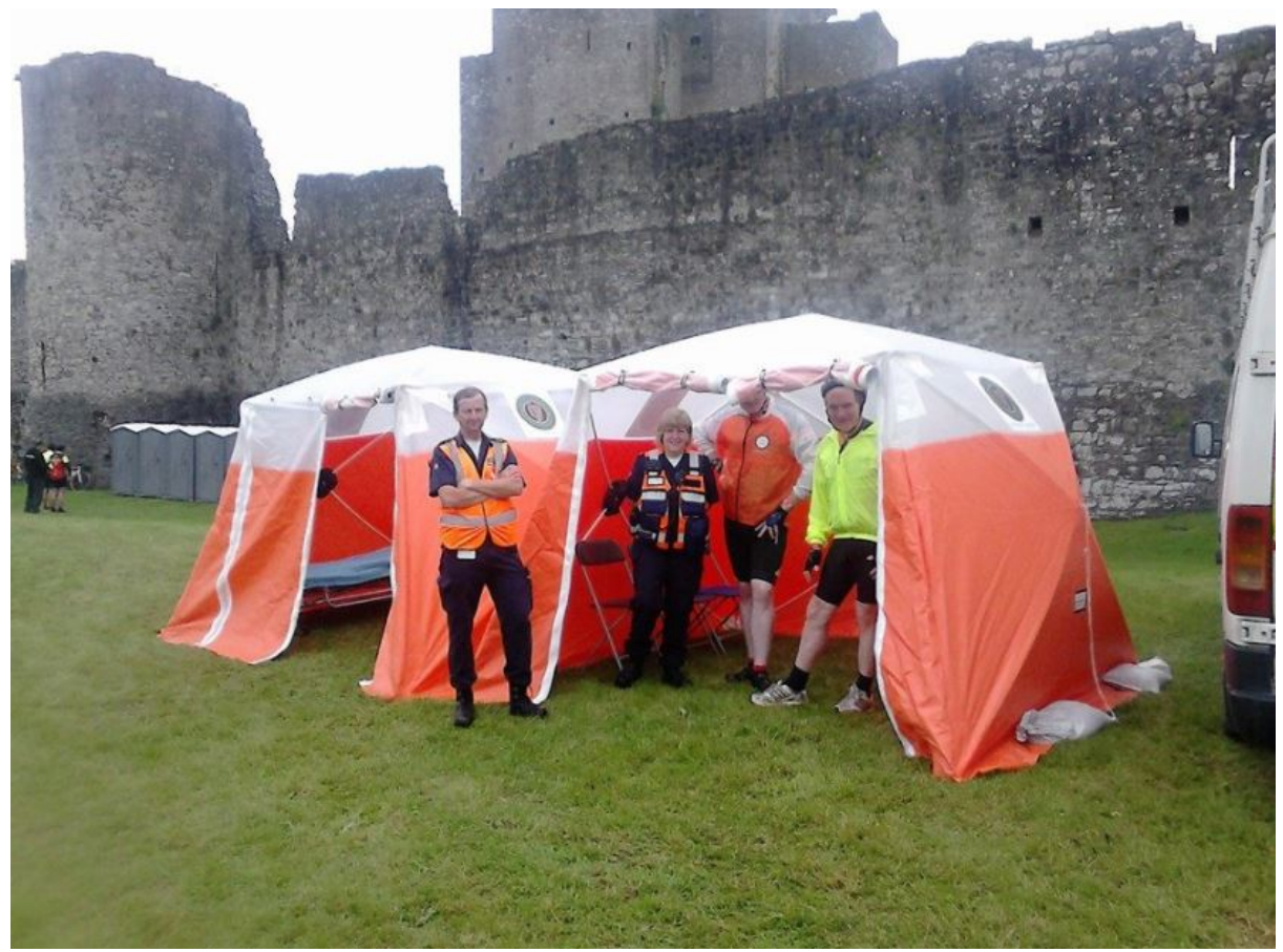
Civil Defence at Heritage Cycle in Trim