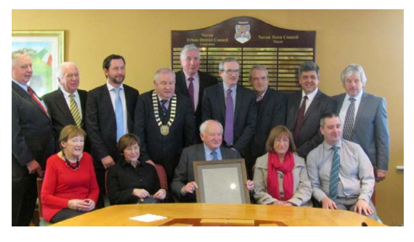
Civic Reception in Navan Town Hall