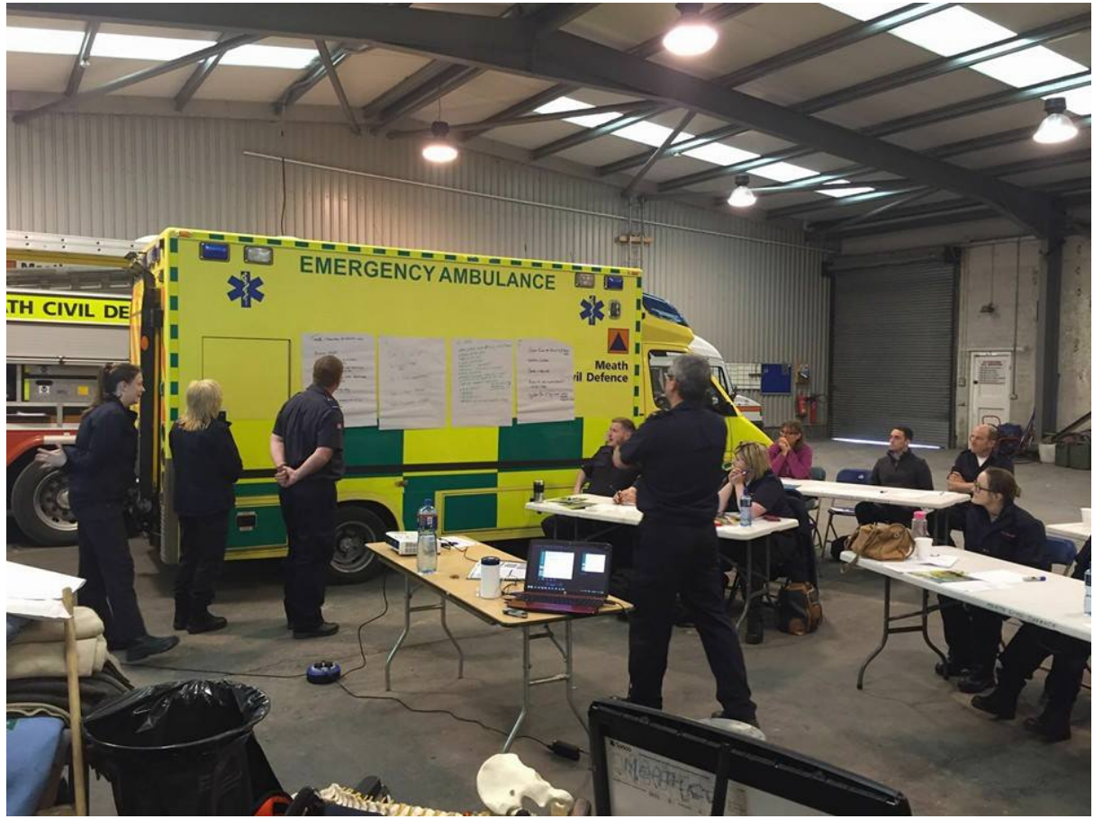
Civil Defence Training Event