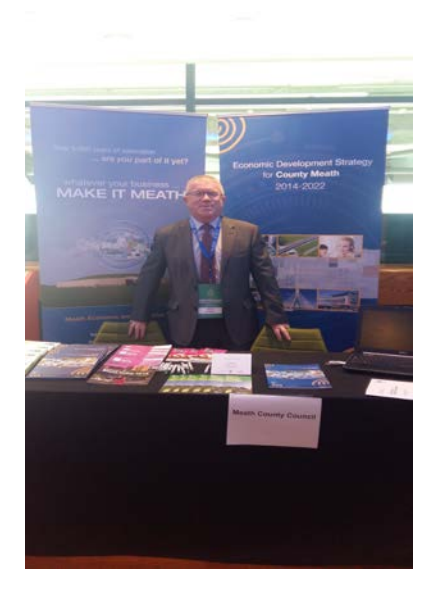
Make it Meath stand at Sister Cities Summit, Croke Park