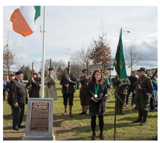
Opening of 1916 Remembrance Garden in Ashbourne