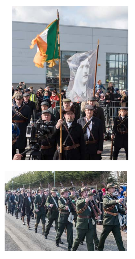
1916 Commemorations in Ashbourne as part of state ceremony