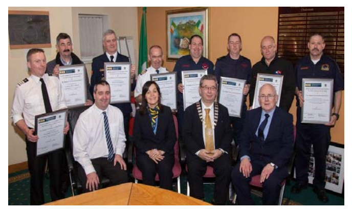
Battle of Ashbourne participants - Presentation to emergency services.