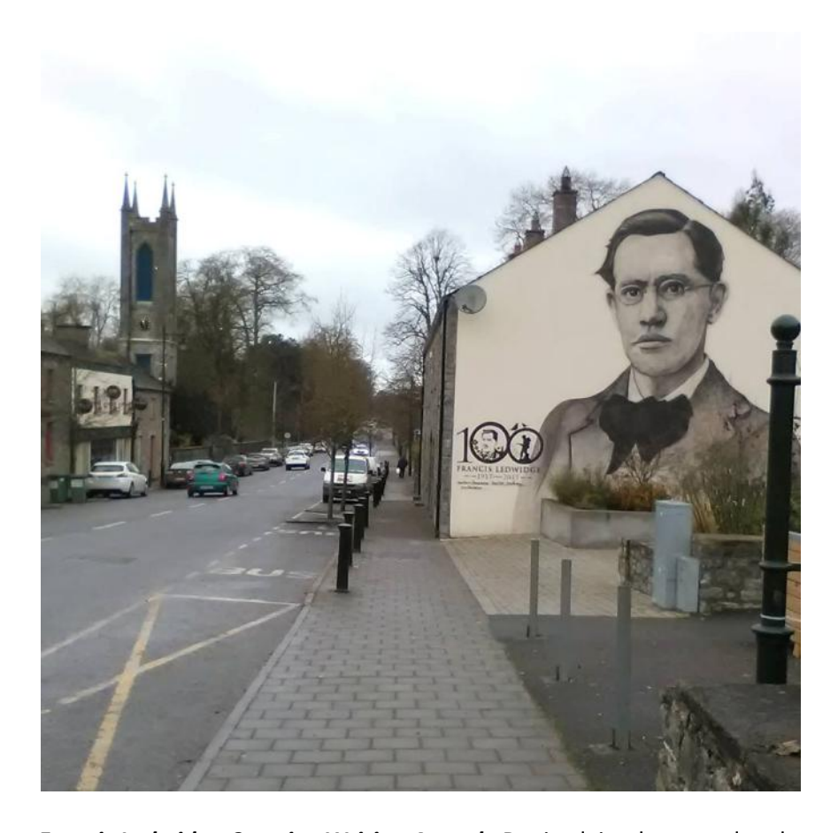
Francis Ledwidge Creative Writing Award - Devised, implemented and managed the inaugural award.