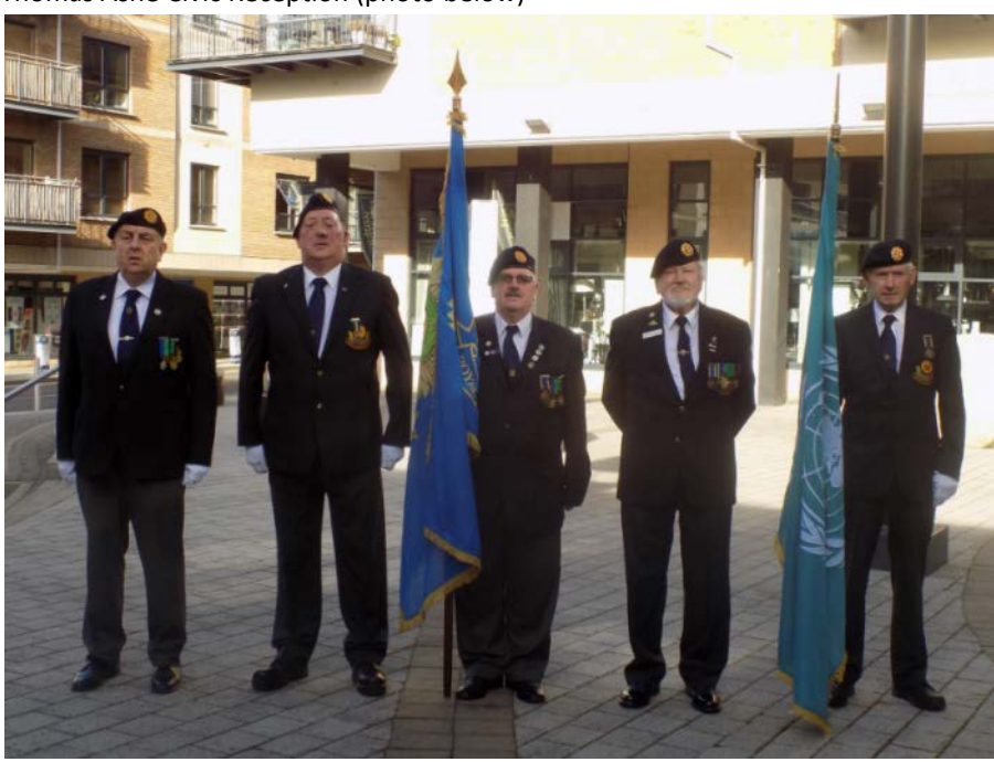
Thomas Ashe Civic Reception (photo below)