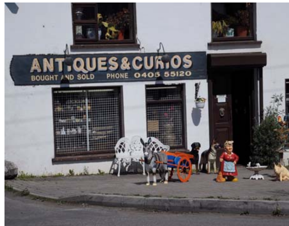
Business Premises in Longwood