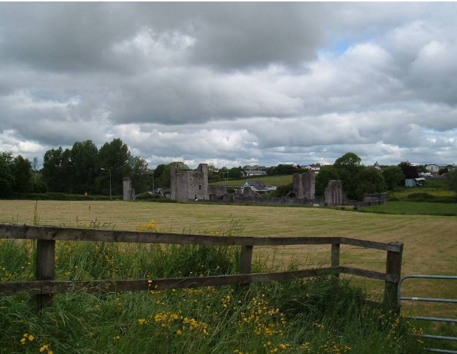
View 10: View of St. John's Friary from the adjoining Dublin Road.