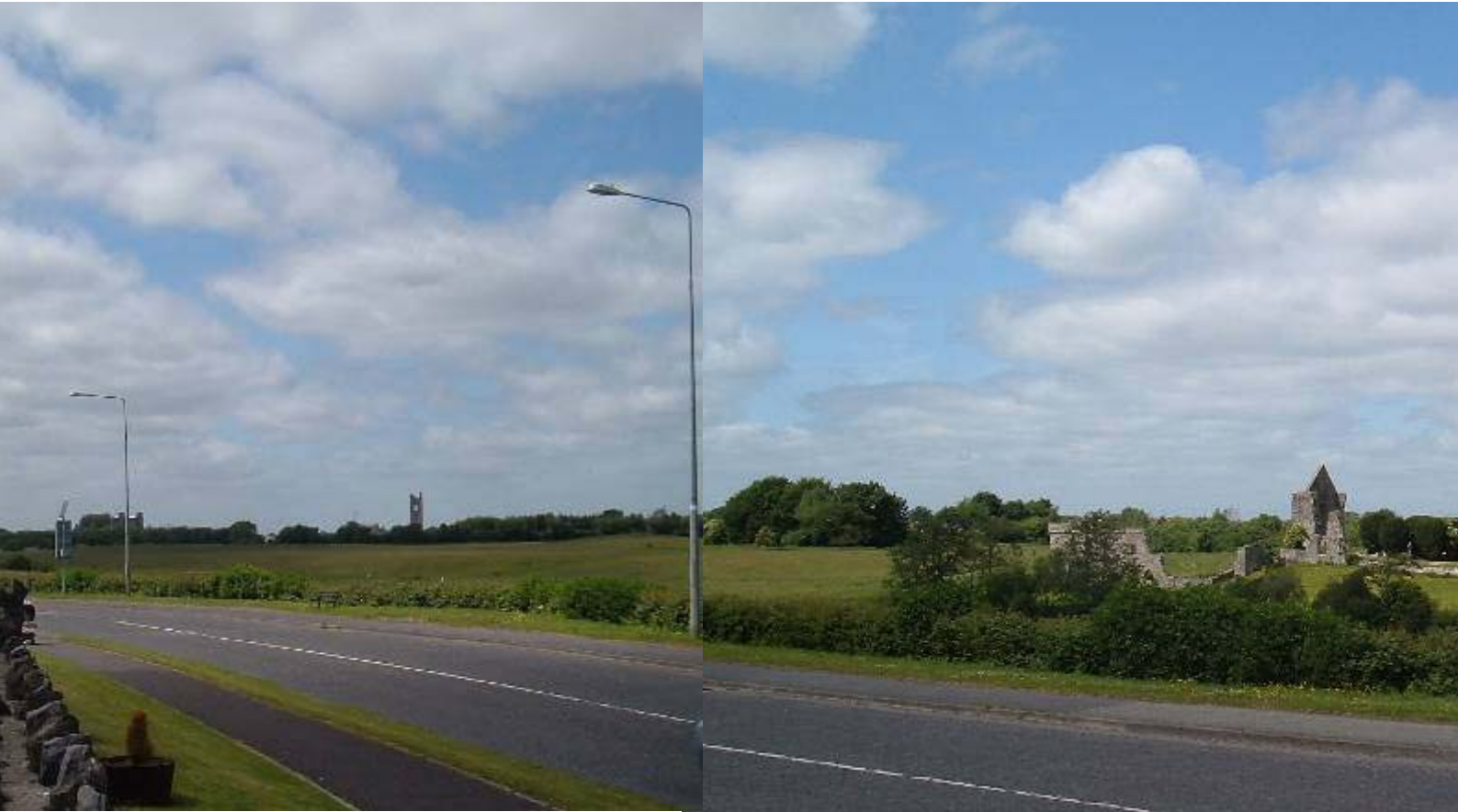
View 1: From Dublin Road at St Johns, toward the river valley.