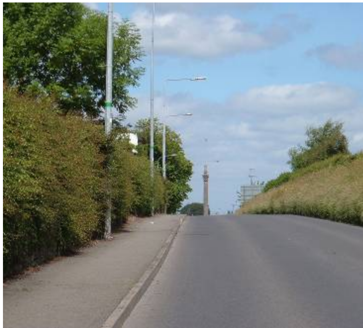
View 11: Views of the Wellington Monument from Patrick's St., Emmet St., and the Summerhill Road