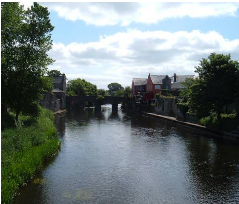
View 4: Watergate Bridge towards the river valley to the west and towards the town centre to the east