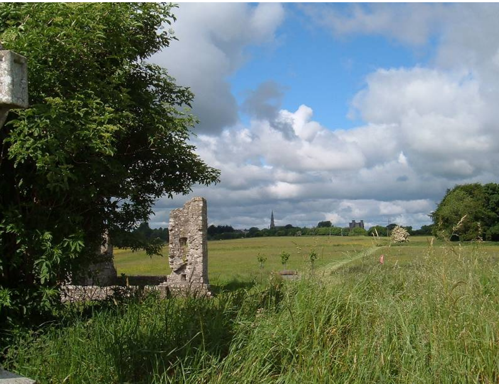
View 7: Westwards from Newtown Abbey to the Porch field.