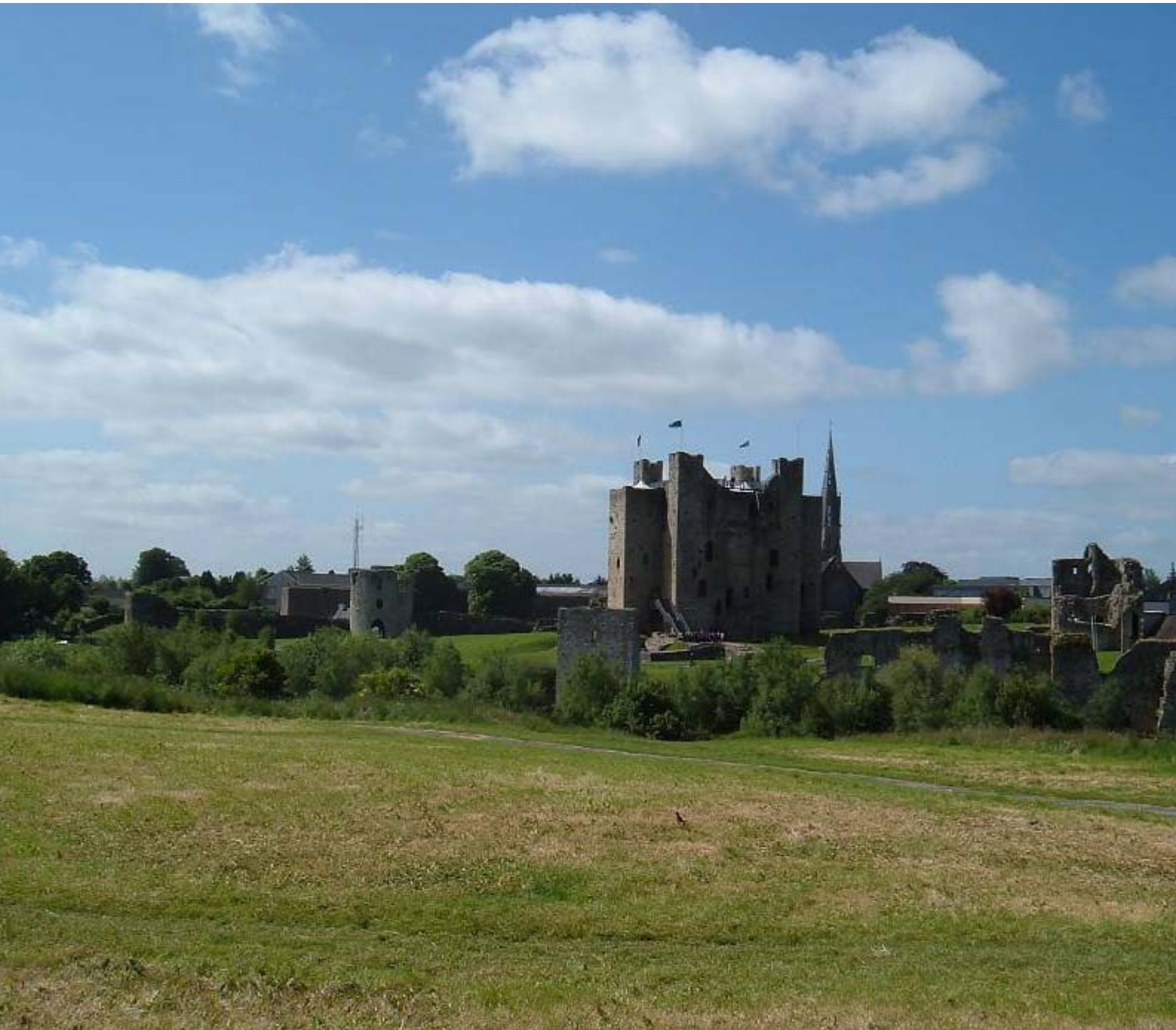
View 6: Towards Trim Castle and the Porch field from St. Mary's Abbey.