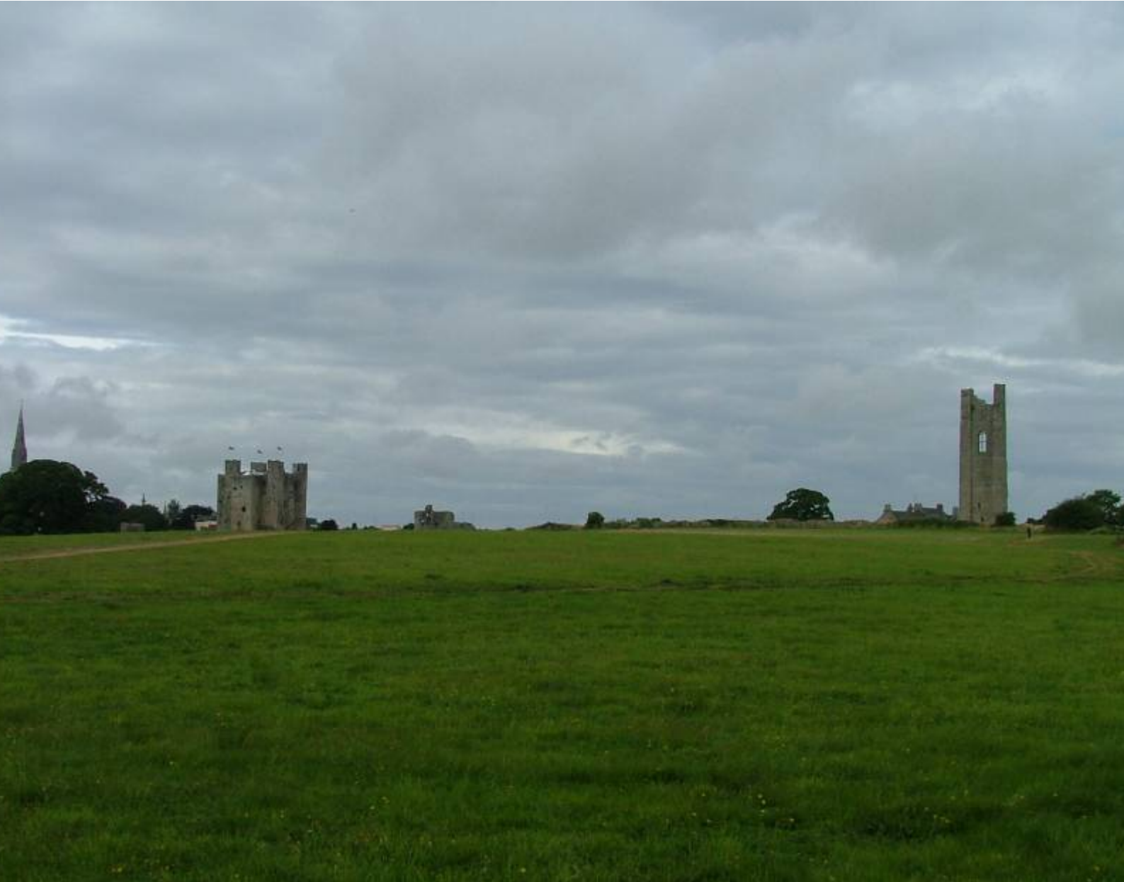
View 8: West and south-westwards from the ring road to St. Mary's Abbey and Trim Castle.