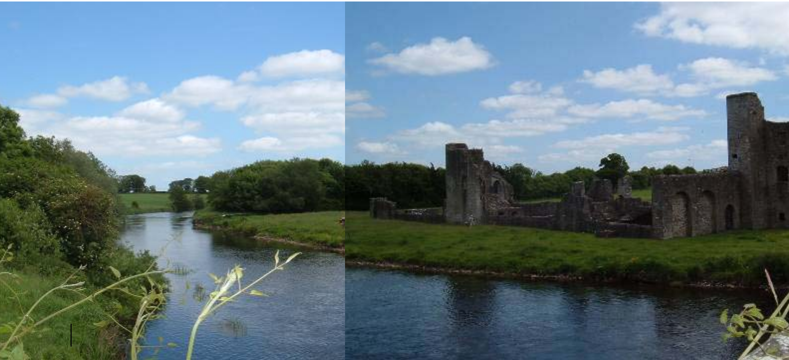
View 2: From Newtown Bridge towards the river valley, Newtown Abbey and St. John's Friary