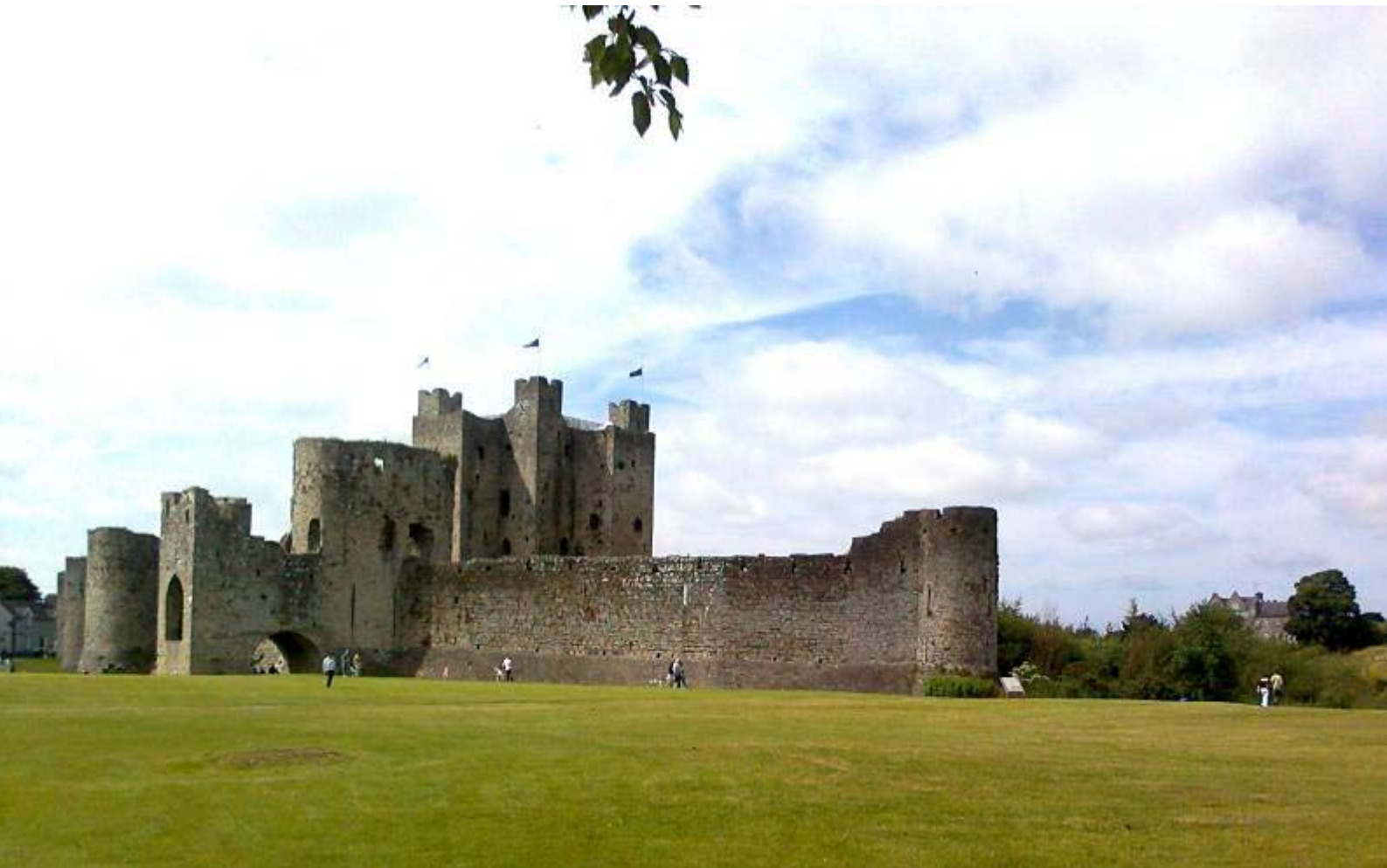
View 5: Castle Street to Talbot Castle and St. Mary's Abbey.