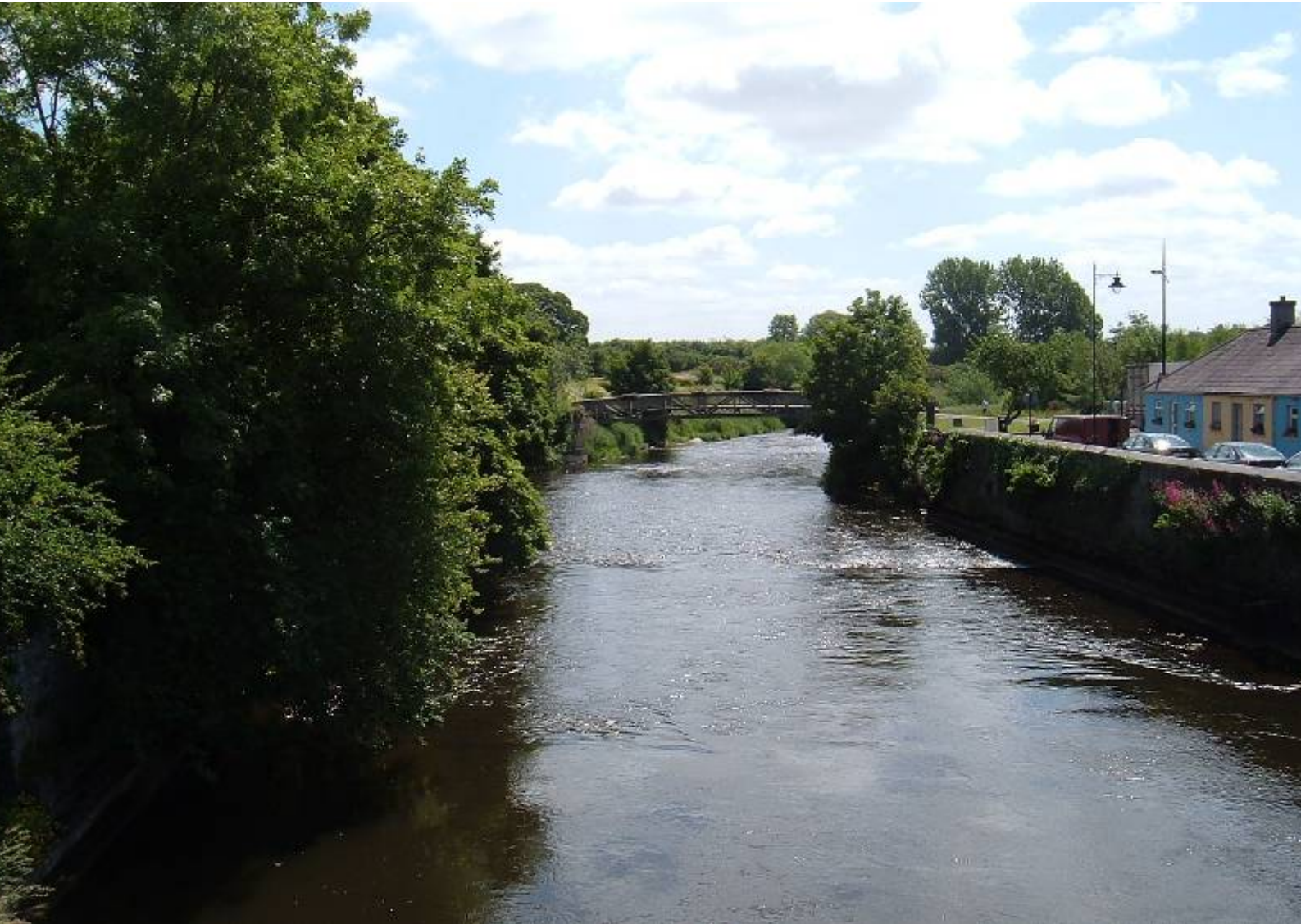
View 9: Eastwards from Oldbridge in High Street.