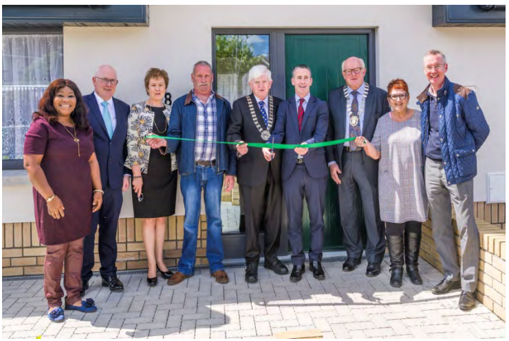
Opening of the new Homes in Proudstown, Navan

Works on 46 units under the Local Authority Adaptation Works Scheme was completed by year end.