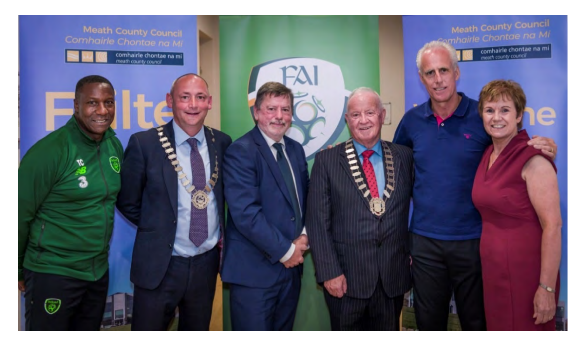
FAI Festival of Football Civic Reception in July

The Corporate Services Communications and Events Unit also manages the organisation of all corporate events and provides external groups with Event Management Guidelines for non-Council events. In 2019, 60 applications for external events were administered including the processing of road closures and rolling road closures.