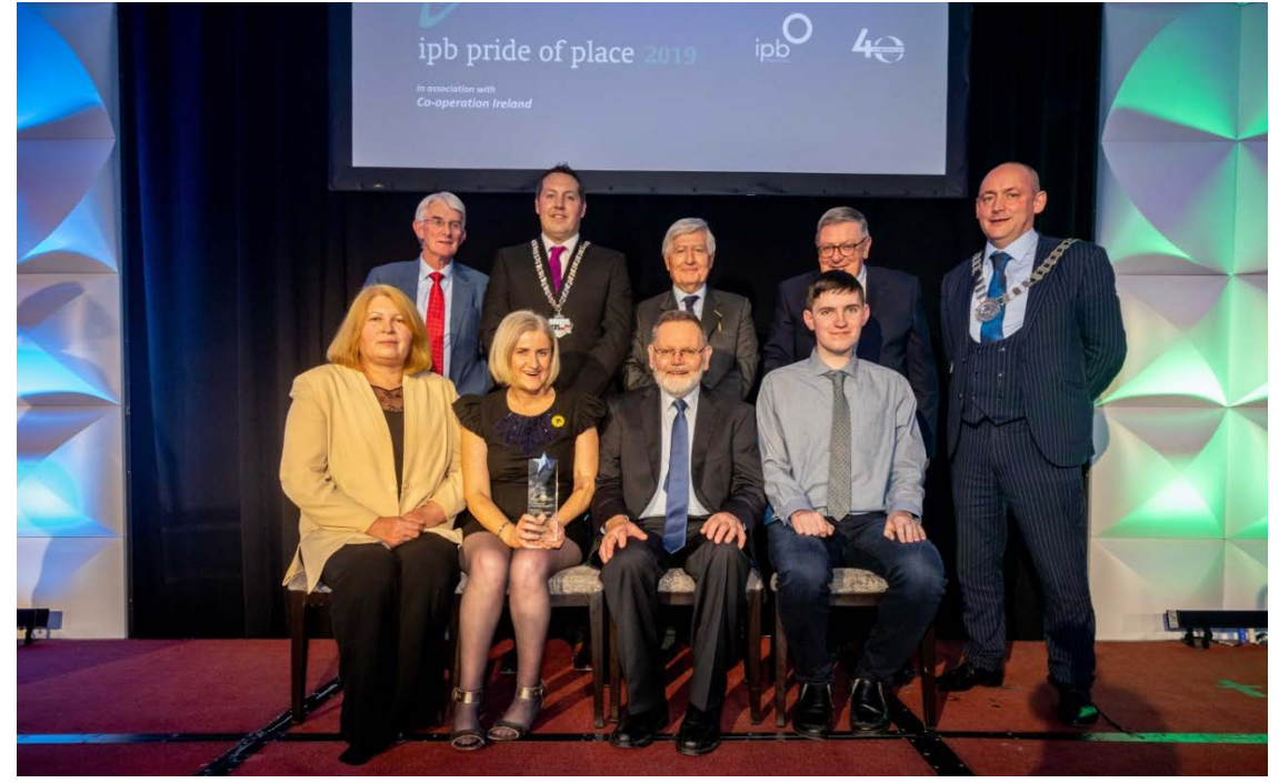
Girley Bog – Winner of Creative Place Category

Pride of Place continued with competitions at Municipal District level, and category winners from each MD going forward to compete at county level. A total of 245 groups and businesses participated, with 65 schools taking part. Three groups were entered in the National Co-operation Ireland Awards which took place in Kilkenny in November, namely: Girley Bog Meitheal, Newcastle Woods estate, Enfield and Dunboyne Tidy Towns Association. Girley Bog Meitheal won in their category, "Creative Place Initiative".