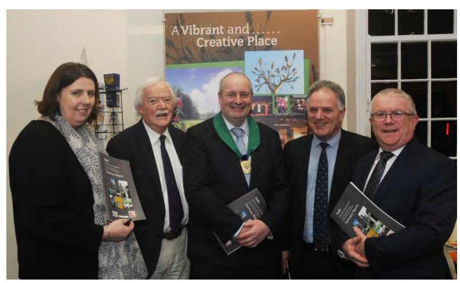
Launch of Kells Report