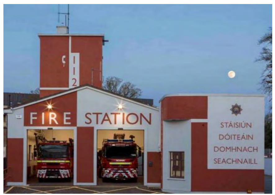
Dunshaughlin Fire Station extended and upgraded in 2019

Dunshaughlin Fire Station was extended and upgraded in 2019, and enhanced welfare facilities provided, following previously approved government Capital Funding allocation.