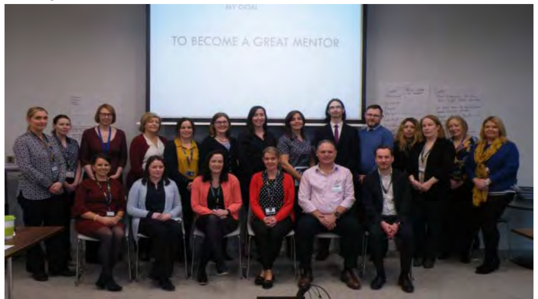
Attendees at the Training session for Mentors

A new mentoring programme was developed and introduced to support the introduction of 20 newly recruited clerical officers to the organisation. The HR department facilitated training for both the mentors (existing staff members) and the mentees (new staff) to assist both groups gain from the experience. Mentoring is being used across the public and private sectors due to its positive impacts on organisations and their workforce.