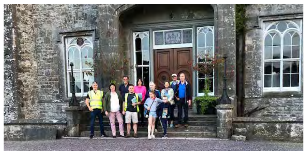
Slane Tidy Towns at Slane Castle taking part in the Swift Survey 2019