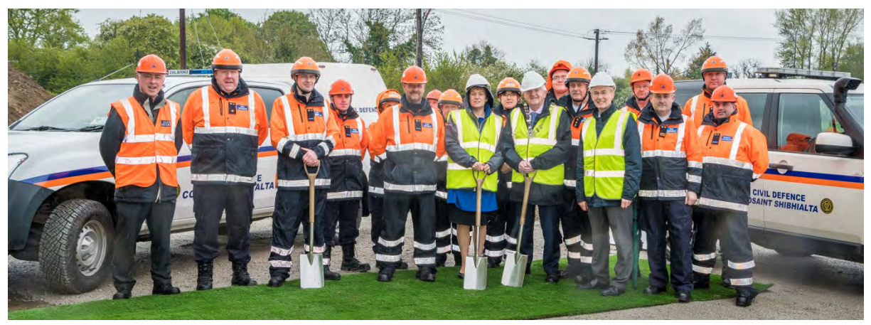
Sod turning for the new Civil Defence Headquarters.

Work commenced on the construction of the new training and operational facility for the organisation on the Mullaghboy Industrial Estate, Navan and is due for completion in April 2020. The facility will be a tremendous asset to the organisation and will provide state of the art training, storage and operational capacity for the organisation to grow and expand the range of supports being provided to the emergency services and the community.