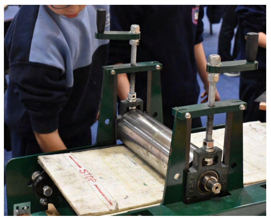
Primary School children at printmaking workshops Toradh Gallery, Ashbourne