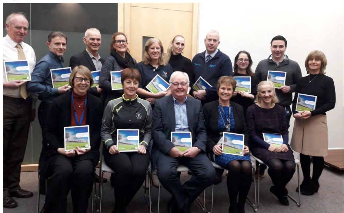
Launch of Healthy Meath Plan

Healthy Meath Strategy 2019-2021: A Healthy Meath strategy was prepared and completed with funding allocated from the Healthy Ireland fund in 2018. The plan was launched by the LCDC in December 2019. Projects from the Healthy Ireland fund shall link into actions identified in the strategy.