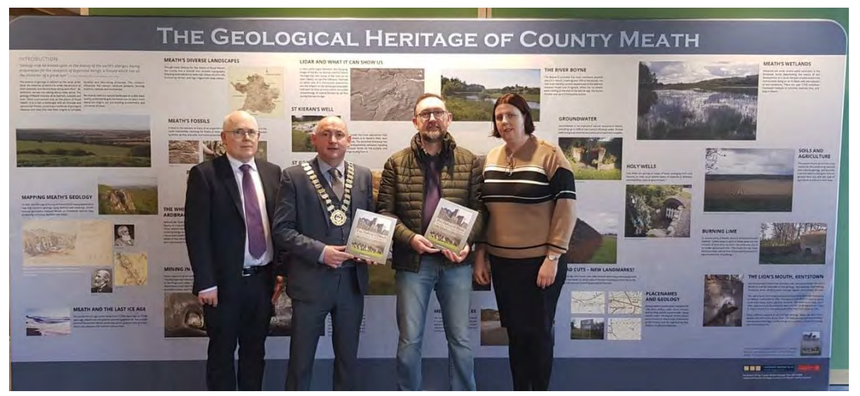
Archaeological Heritage of Meath