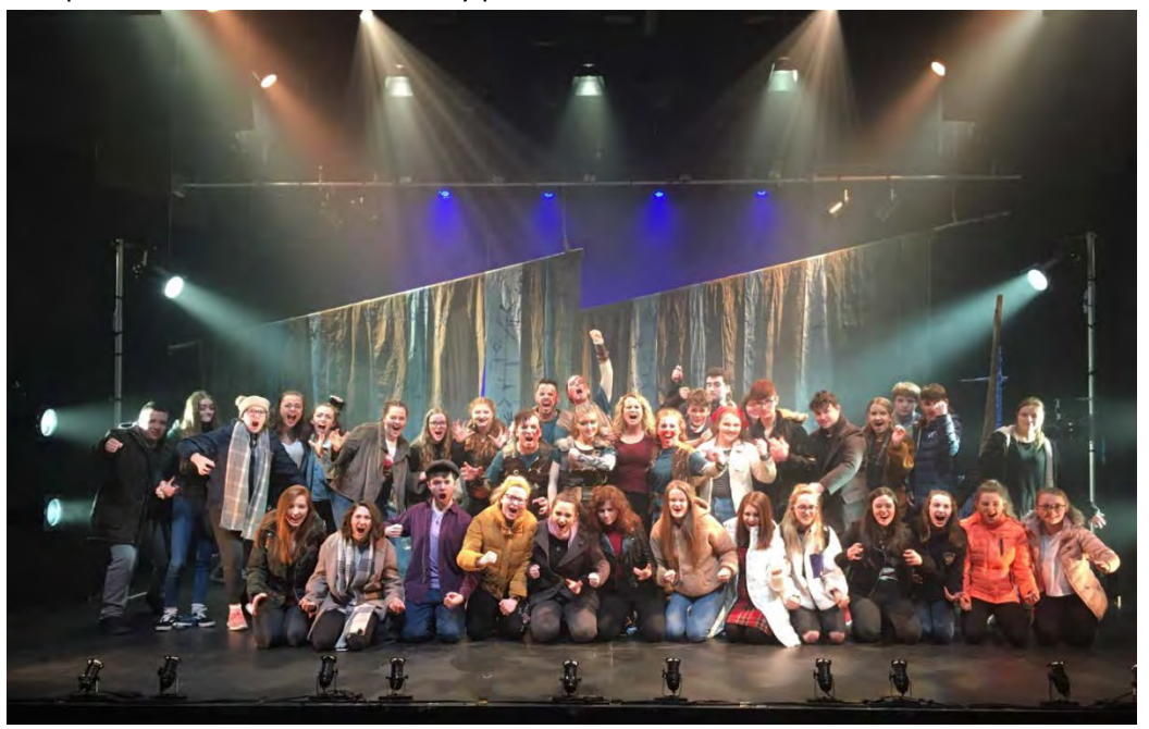
Warrior of the Táin Theatre Trip

• Formal partnership arrangement agreed with Meath Youth Theatre – Act Out Youth Theatre and expansion for same across county planned.