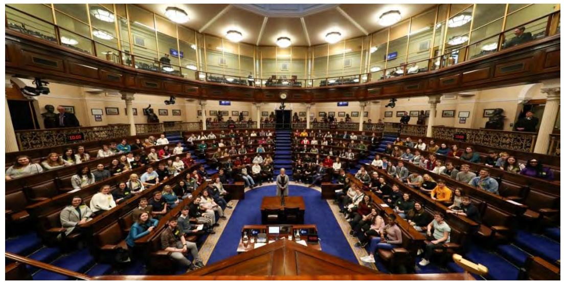
Dáil na n'Óg

The group attended the Dáil in November to celebrate 100 years with TD's and the Ceann Comhairle in attendance.