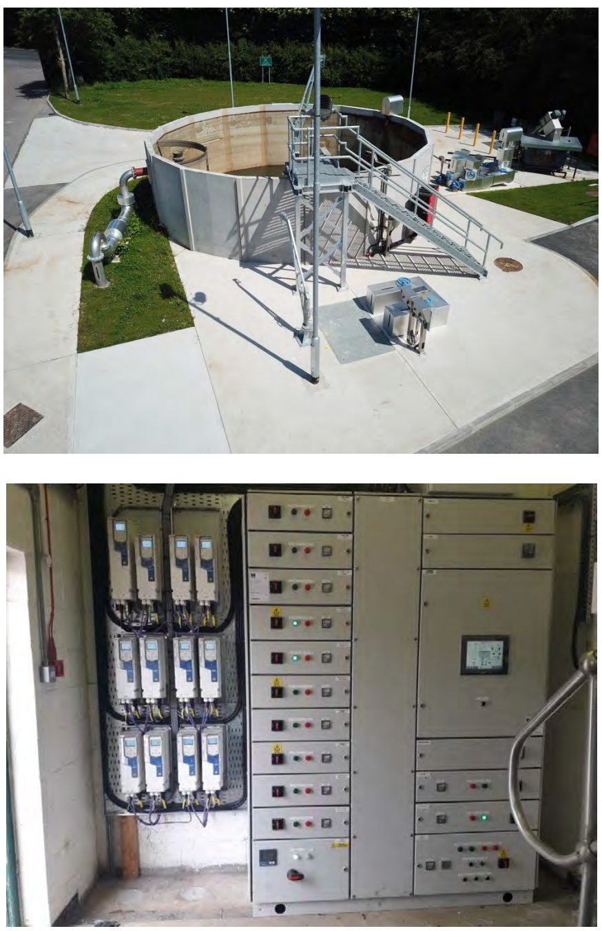
Upgrade works completed at Kentstown Wastewater Treatment Plant

In addition the Council progressed the planning / construction of several other major projects, including;