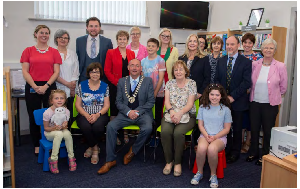
Opening of the Upgraded Slane Library

• 6,163 children attended the hundreds of Summer Programme events organised by the library service during July and August.