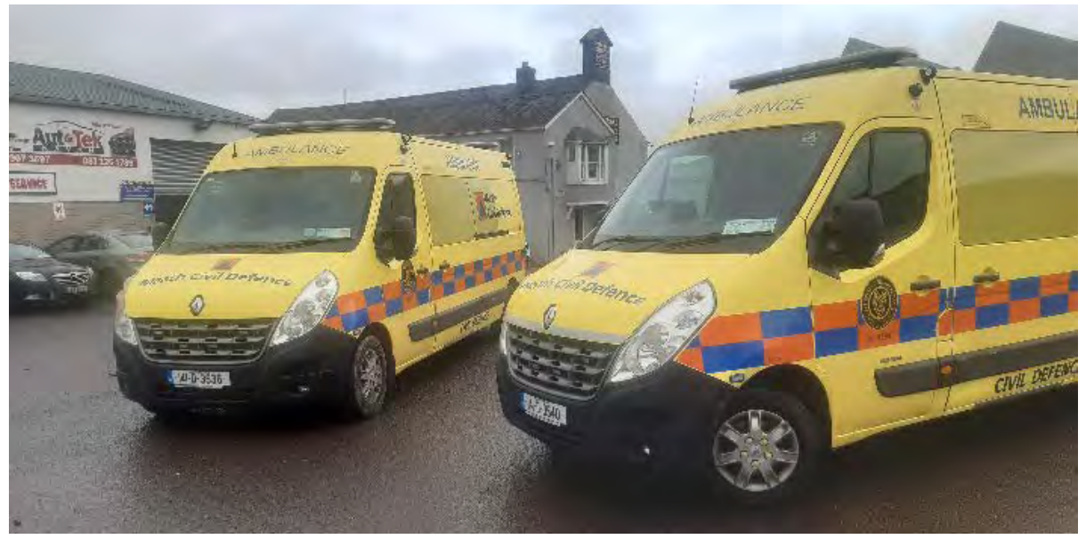
Additions to the Civil Defence Fleet

The national Civil Defence Branch issued the organisation with a new 4 x 4 crew-cab jeep and two of the older ambulances were upgraded to newer models. Three bicycles were purchased, and a medical cycle unit established providing additional resources to enable volunteers to continue providing excellence in service.