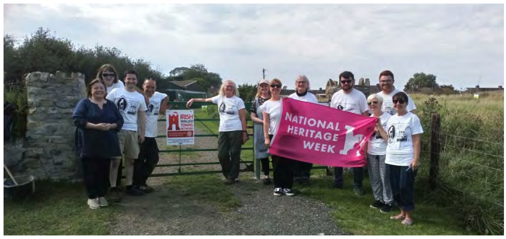
Blackfiary Archaeology Dig

National Biodiversity Action Plan Funding - Projects delivered using this funding included: