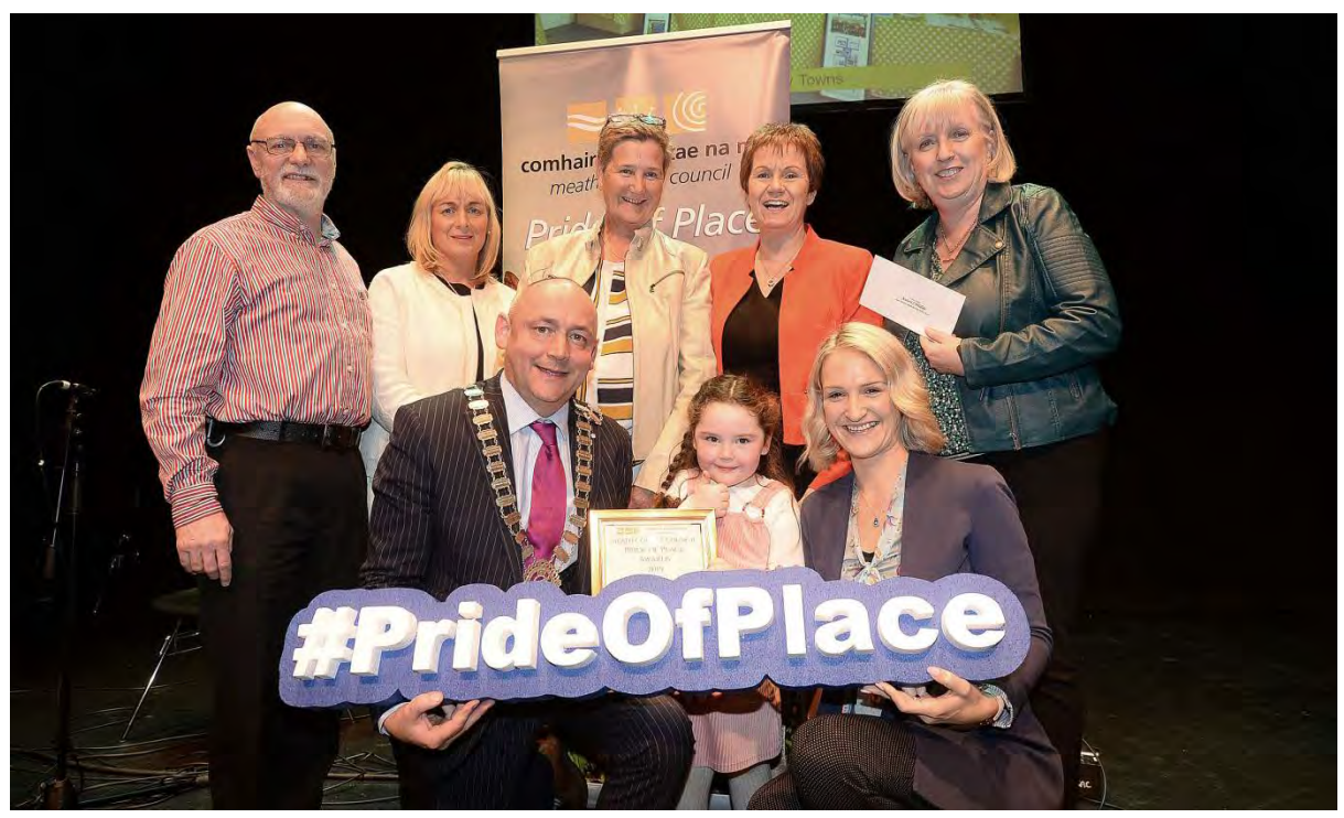
Joint Winner of Nature Wildlife Award – Dunboyne Tidy Towns