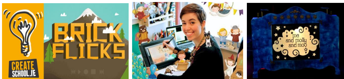
Some of the initiatives from the successful Cruinniú na nÓg 2020