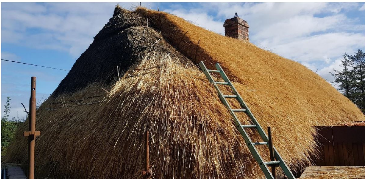
Thatching of a Protected Structure at Newtown, Trim.

Built Heritage Investment Scheme 2020 and Structures at Risk Fund for 2020: Conservation works funded through the above grant streams are currently on-going and due for completion at the end of October.