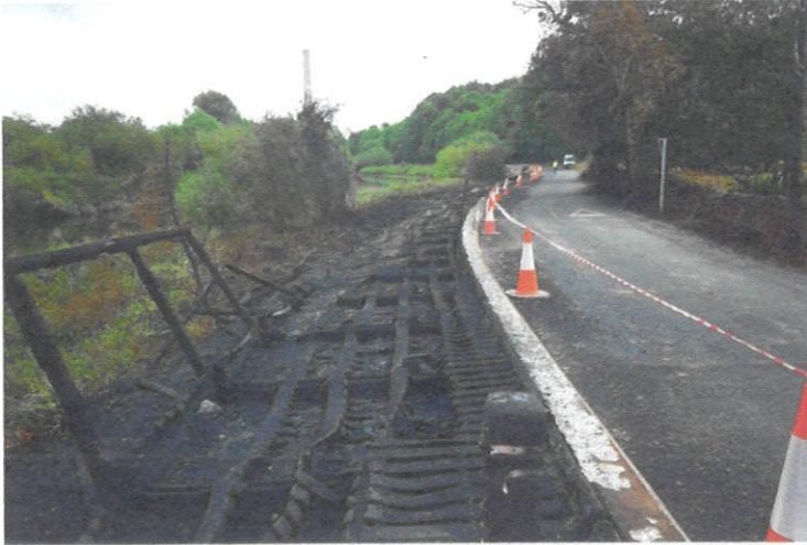
Fire at Oldbridge

On 28 th July 2018 at midnight, firefighters were called to a fire on the Board walk at Oldbridge, Drogheda. Vandals set it on fire and caused a lot of damage.