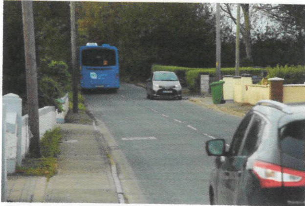
(Busy Tower Road R151)