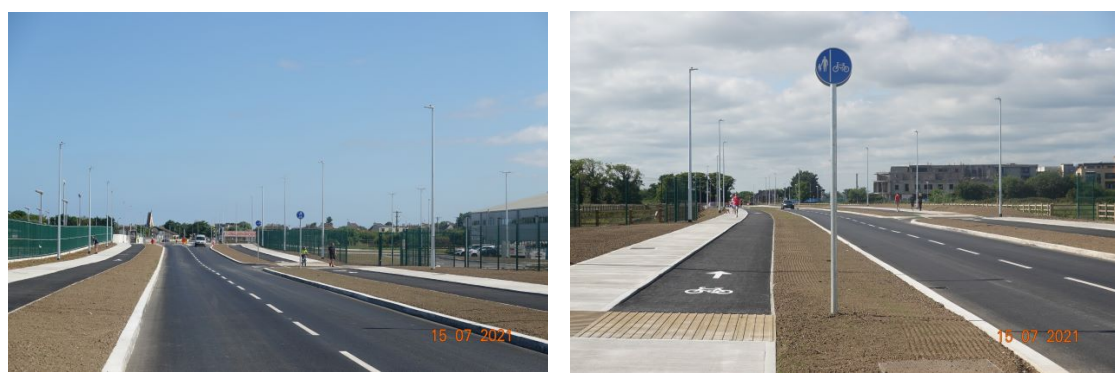
R150 Laytown to Bettystown Road Scheme – Proposed to be named Tara Road