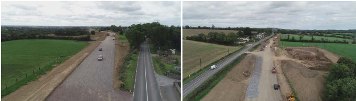
Works on the N51 Dunmoe Phase2 scheme