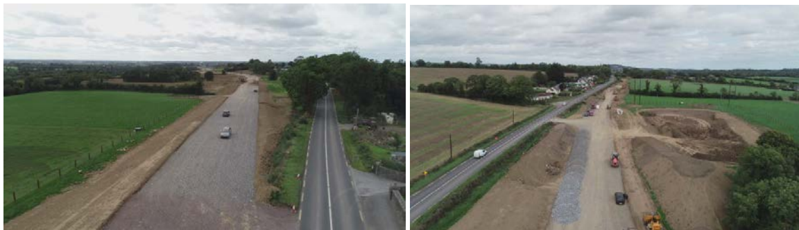
Works on the N51 Dunmoe Phase2 scheme