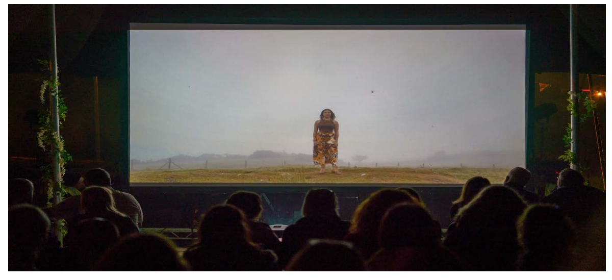
Until The Dew Falls screening, Dunderry Park.

This saw the production of two separate short performance films: Until the Dew Falls , a musical celebration of the autumn equinox and All Rise - The Courthouse Sessions , featuring live sessions at Kells Courthouse. Until the Dew Falls was premiered on September 25<sup>th</sup> at a live event and across the Hot Press social media platforms, achieving a global audience of over 10,000 viewers.