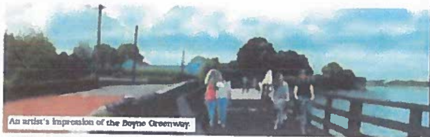
An artist's impression of the Boyne Greenway.