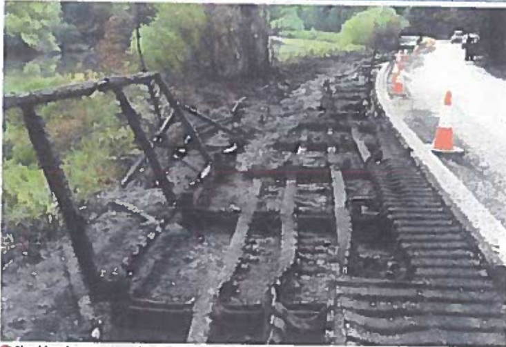
Shocking damage caused to the walkway in Drogheda, Co Louth

https://www.irishmirror.ie/news/irish-news/oldcastle-drogheda-fire-attack-boardwalk-12989515