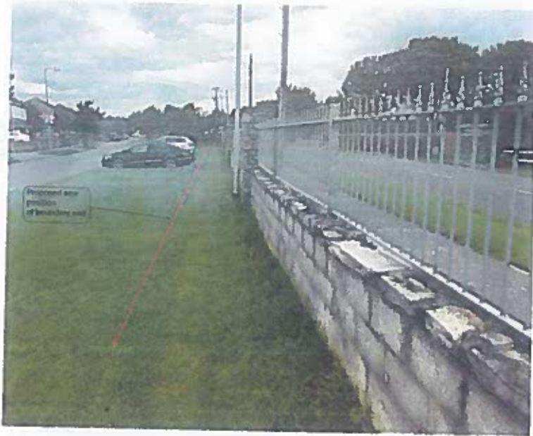
Photo of proposed loss of green area in moving boundary wall.