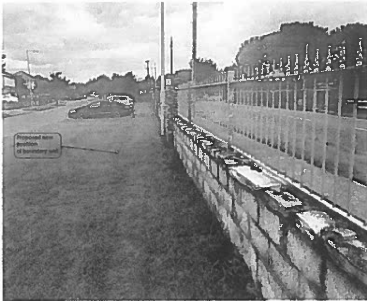
Photo of proposed loss of green area in moving boundary wall.