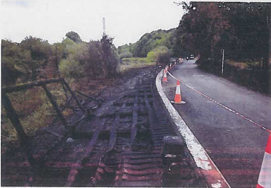
Fire at Oldbridge.

On 28th July 2018 at midnight, firefighters were called to a fire on the Board Walk at Oldbridge, Drogheda. Vandals set it on fire and caused a lot of damage