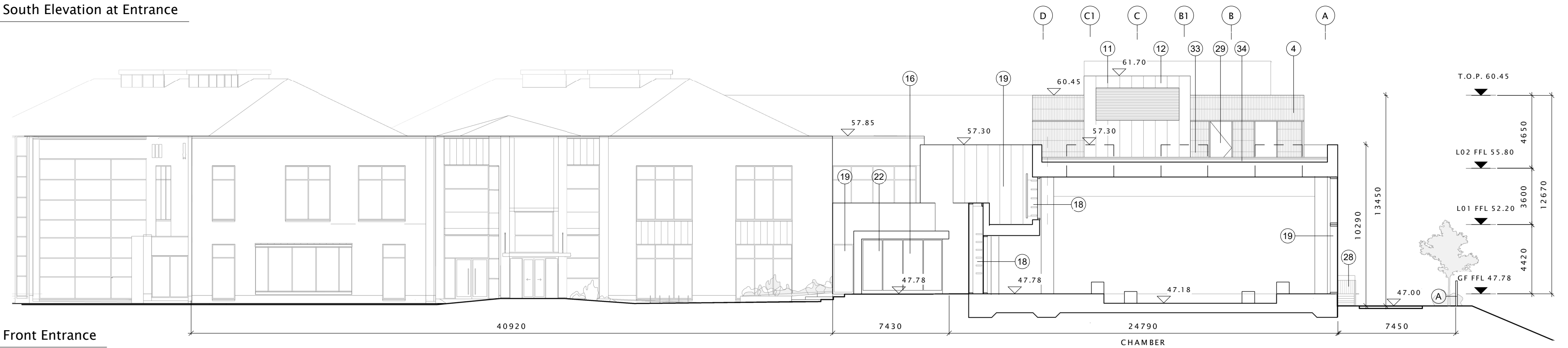
3 Proposed Front Entrance 1 : 200