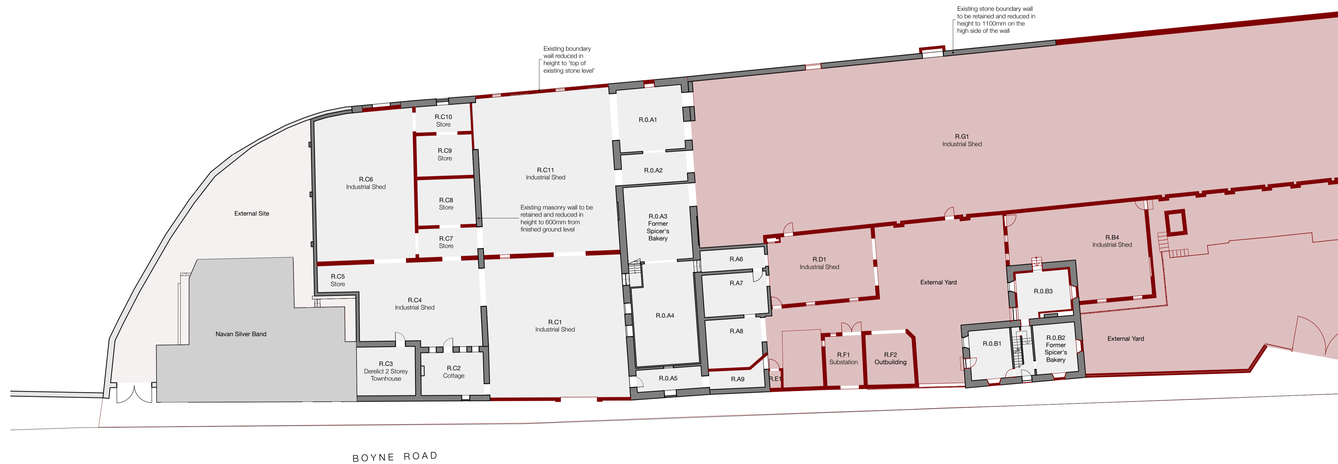
Demolitions to Site Plan 1:200