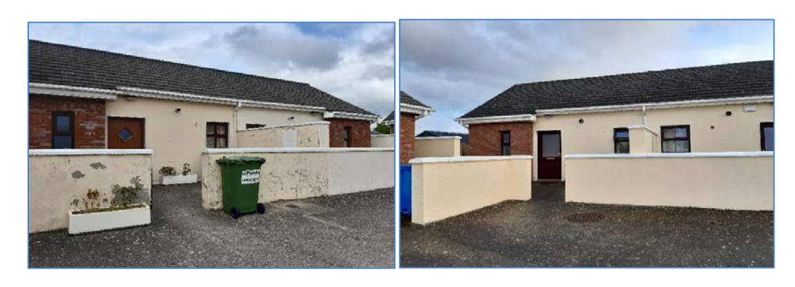
Lagore Crescent, Dunshaughlin - Pilot Estate Management Initiative (Before & After)