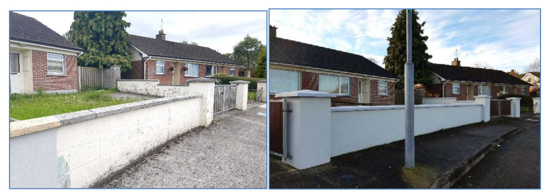
Willie Black Crescent, Kells

Examples of Estate management funding was used for refurbishment works at Willie Black Crescent Kells and Lagore Crescent Dunshaughlin.