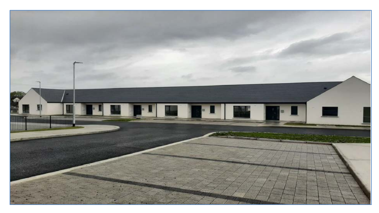
Meath County Council Site Direct construction – Staleen Park, Donore (€4m)