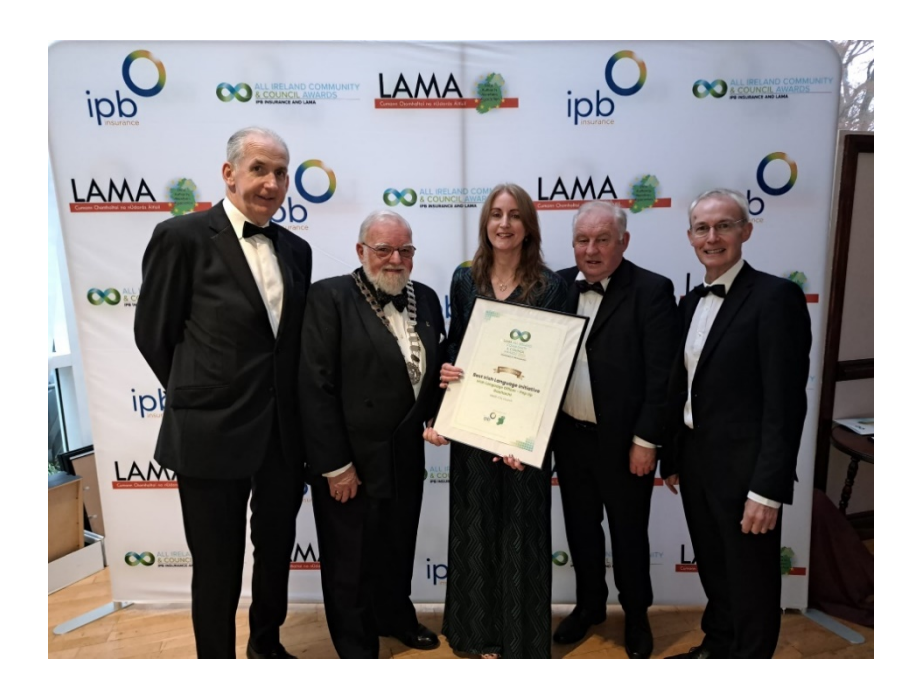
Irish Language Officer & Councillors at Lama Awards - Clonmel