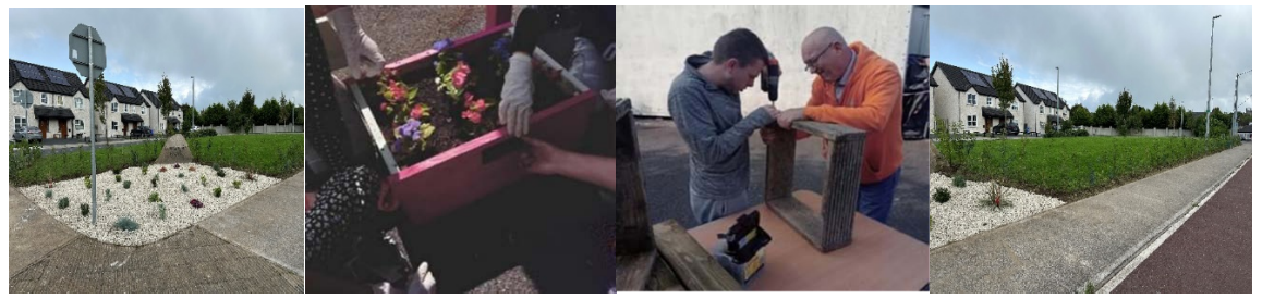
Photo 6: Connaught Grove Athboy - Examples of Estate Management Funding

The young people created a video of the works they completed. A presentation by the Cathaoirleach and Mayor of Navan took place in Buvinda House on the 2nd of November 2023 to acknowledge their hard work.