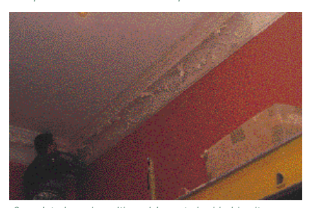
Completed cornice with enrichments bedded in situ.