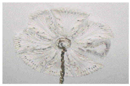
Missing elements are easily copied and replaced

mould can be taken in situ or made from a portion of the detail taken down and made on the bench