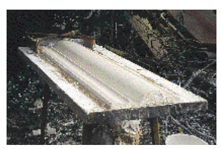
Reverse mould showing template and horse in position.

The same process is employed to make the reverse mould as the run mould, with the exception that the template is made in the reverse of the profile, and it is not necessary to use scrim or laths.