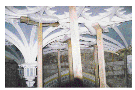
Ceiling supported from below.

A failed key in a decorative ceiling, which results in sags and bulges, should be refixed into position in order to save the ceiling. The first stage of this operation involves supporting the affected areas of the ceiling from below. Expanded polystyrene is needed to cushion the areas between the ceiling and supports.