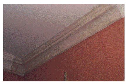
The plain face cornice secured in position.

squeezing the cast firmly into position and making sure that it is in line and flush with the existing work. Cornices can be secured in position with non-ferrous screws. For enriched cornices, their plain face is run or cast containing the beds for enrichment; this is then fixed in situ. The lines of cast enrichments are subsequently planted in the prepared beds.