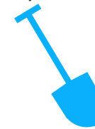
Shovel, multi-tool knife and whistle