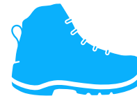
Clothes, strong shoes, hats and sleeping gear