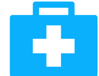
First Aid kit, toiletries and prescriptions