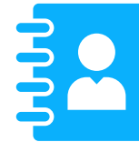
Contact details/ pencil and paper