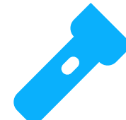
Torches, candles and waterproof matches