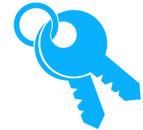
Keys, bank cards and cash, spare house/car keys