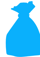
Large plastic bags and duct tape