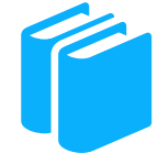
Books, playing cards and board games