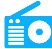
Battery operated radio with spare batteries