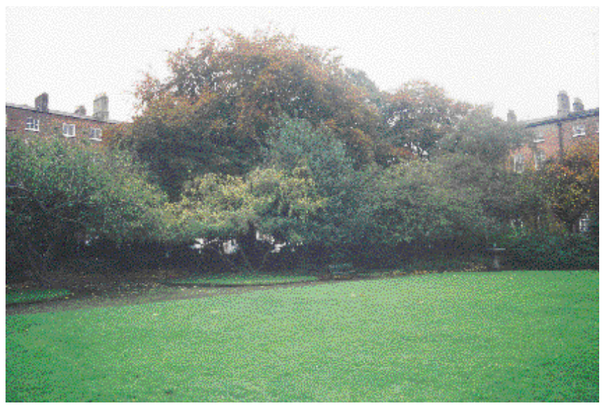
Centre garden is setting for historic square

It may be that not just one building is involved but a whole group of buildings comprising a conservation area. The open spaces within a conservation area should be conserved or restored in a manner which is appropriate to the historic buildings surrounding them. In a city, town or village, such open spaces are usually in the form of squares, parks,greens,streets or malls.