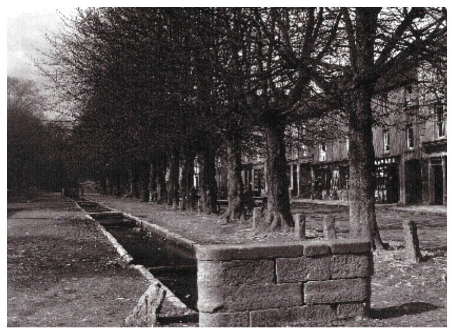
Trees, and other plants, can be an integral part of a streetscape.