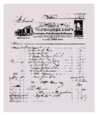
Nineteenth century invoice for historic garden

(ii) Written evidence which has been recorded in topographical books and manuscripts,estate papers and accounts, inventories,deeds, leases, sales particulars, building contracts and accounts,plant and planting lists,letters and diaries.