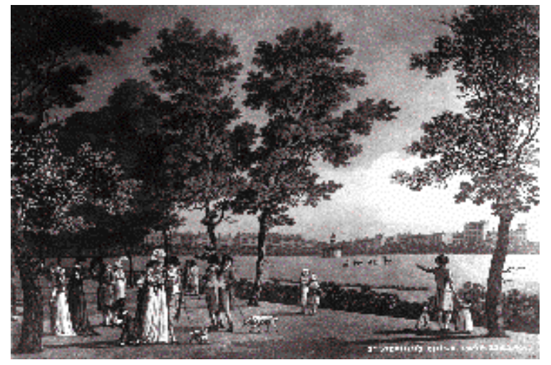
Historic view of St.Stephen's Green, Dublin

The preparation of a maintenance manual will greatly assist the gardening staff in maintaining the newly-created setting or garden. (Archival accounts may include items of payment for specific maintenance tasks carried out during the garden's histor y. These may provide useful information in dr awing up the maintenance manual). If the garden is open to the public, problems in terms of handling visitors as well as in maintenance and improving on what has already been established may emerge and have to be solved. For this reason a post-restoration maintenance review procedure should be put in place.