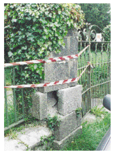
Entrance pier in need of repair, showing relative thinness of stones

At entrances to estates exquisite ashlar stone is often seen with mortar joints of as little as 3 mm and less. Piers and capping may display classical or gothic design in their elements. These walls may give the appearance of having large or even massive stones but this can be an illusion and the stones are often relatively thin.