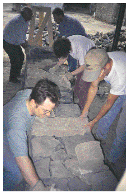
Laying through stone in double dry stone wall