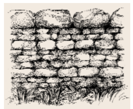
Double dry stone wall

These are built with two faces tied together with through stones. Stone foundations when provided are rarely laid deep and no consideration is allowed for frost heave as unlike a mortared wall, such movement has little or no effect on a double dry stone wall. The centre is carefully hearted with smaller stones and the coping is laid locking the top together and preventing dislodgement of individual stones. The style of coping varies from place to place and is worth preserving rather than introducing foreign styles from outside the local area. These are the most stable of dry stone walls and if built well, require little maintenance. They provide a natural hiding place for many wild animals. Like many dry stone walls, instead of having a vertical plumb face they often incorporate a batter.