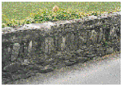
Pleasing stone wall

See booklet No. 4 Mortars, pointing and renders