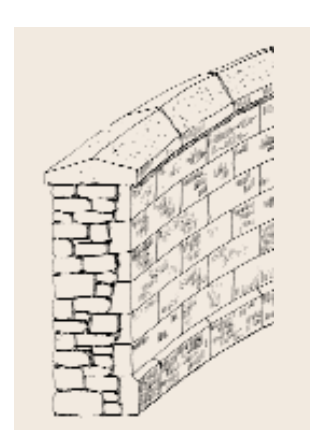
Rubble stone backing (sometimes brick) laid in lime mortar

These walls are usually laid on a stone foundation with through stones a corefill of stone and mortar and a coping. They are laid coursed or uncoursed with cut or uncut rubble. The quality of these walls varies from well cut stone laid with tight joints to any available rubble stone laid roughly to a line. The latter type of wall in some areas was wet dashed with lime mortar on completion and this should be done when repair work is being carried out. This is a tradition in itself worth preserving. A notable feature in just about all of these walls is the coarseness of the aggregate and the whiteness of the putty lime used. The texture and colour that these impart to the mortar can be guite beautiful.