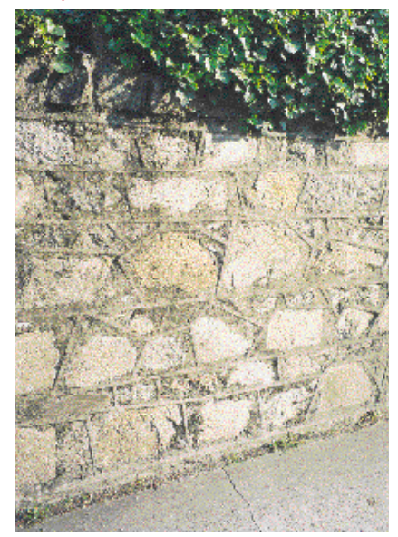
Example of crude pointing