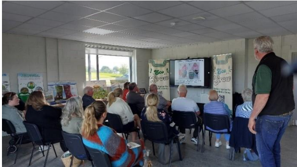
Picture 1 Attendees at an EcoGrow Event