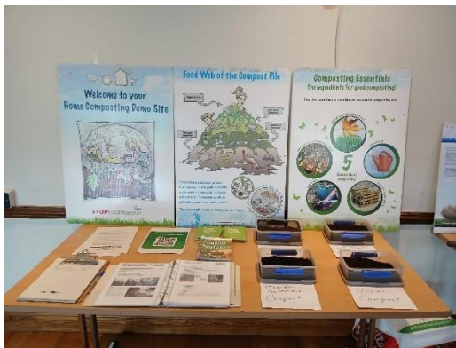
Picture 2 Composting information at an EcoGrow Event