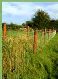
Coppiced hedgerow fenced. Temporary fencing should be sufficient, provided new growth is routinely trimmed correctly, resulting in a stockproof hedgerow.