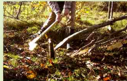
Cleaning the stump